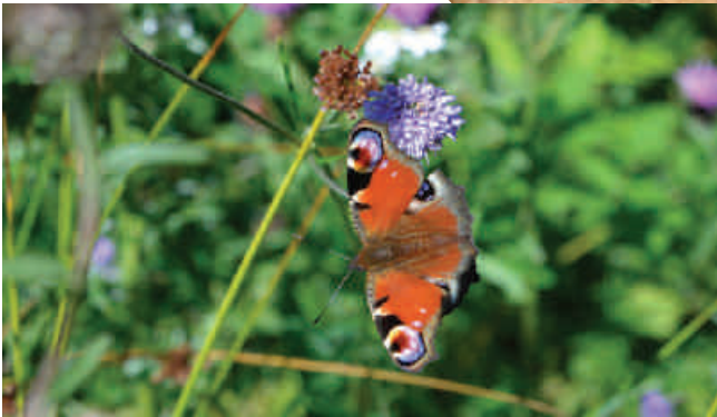
The meadow flowers on the peninsula attract large numbers of insects, such as this peacock butterfly.