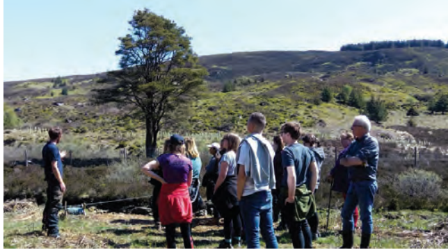
Guided walk to see the Scaup Pine

These high hillsides above Kielder are home to a few 170 year old Scots Pine trees, perhaps the only native Scots Pines in England. Volunteers are collecting seeds from these trees and restoring Native Upland Pine Woodland habitat that thrived here in prehistoric times. Kielderhead Wildwood connects to other nature reserves, creating a huge area of highly resilient ecosystem that will store carbon, help water quality and be home to rare native species like golden eagle and pine marten.